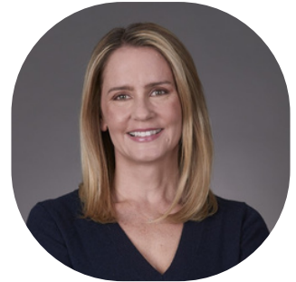
Maura Kennelly Deputy Commissioner of External Affairs NYC DOHMH