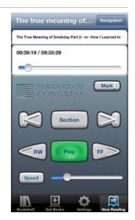
BARD Mobile App