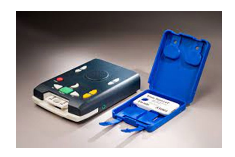
Digital Talking Book Machine