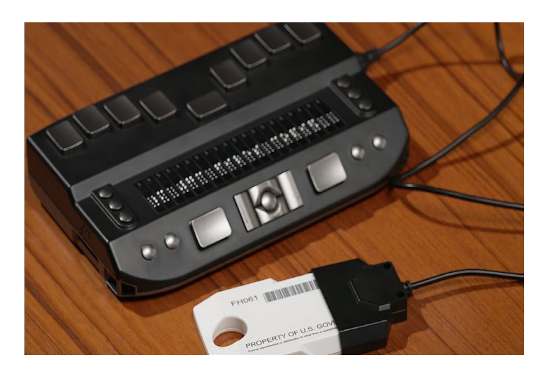
Refreshable Braille eReader