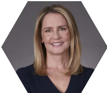
MAURA KENNELLY DEPUTY COMMISSIONER OF EXTERNAL AFFAIRS NYC DOHMH