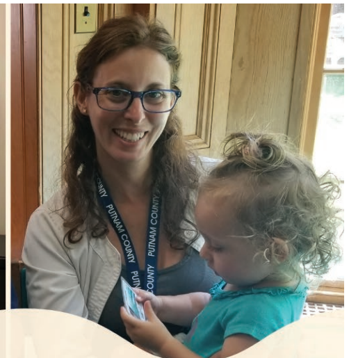
A Putnam County Nurse and her daughter facilitated a New Parent Support group.