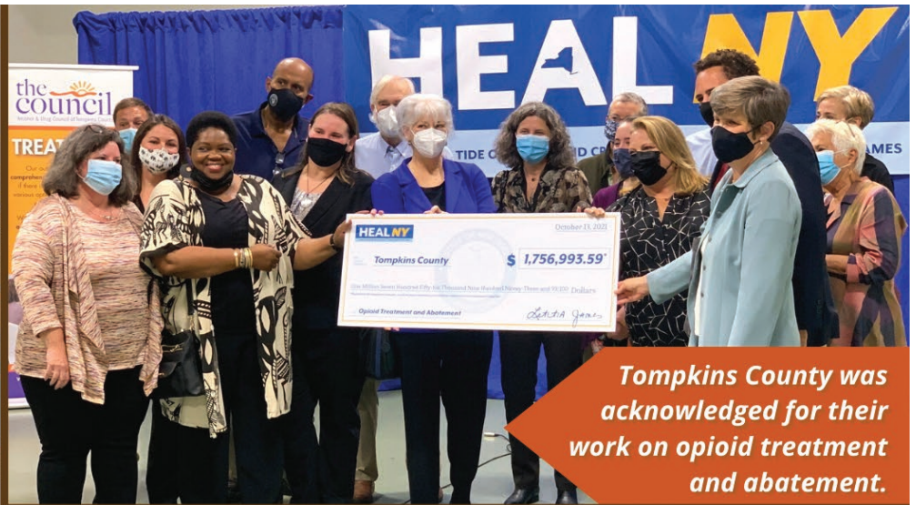
Tompkins County was acknowledged for their work on opioid treatment and abatement.