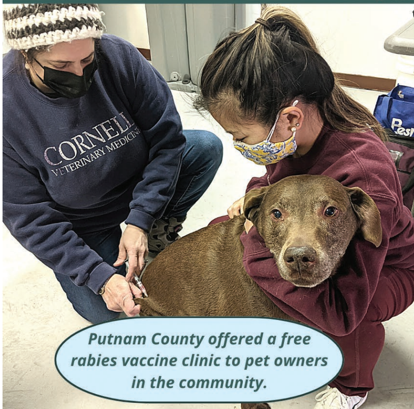
Putnam County offered a free rabies vaccine clinic to pet owners in the community.