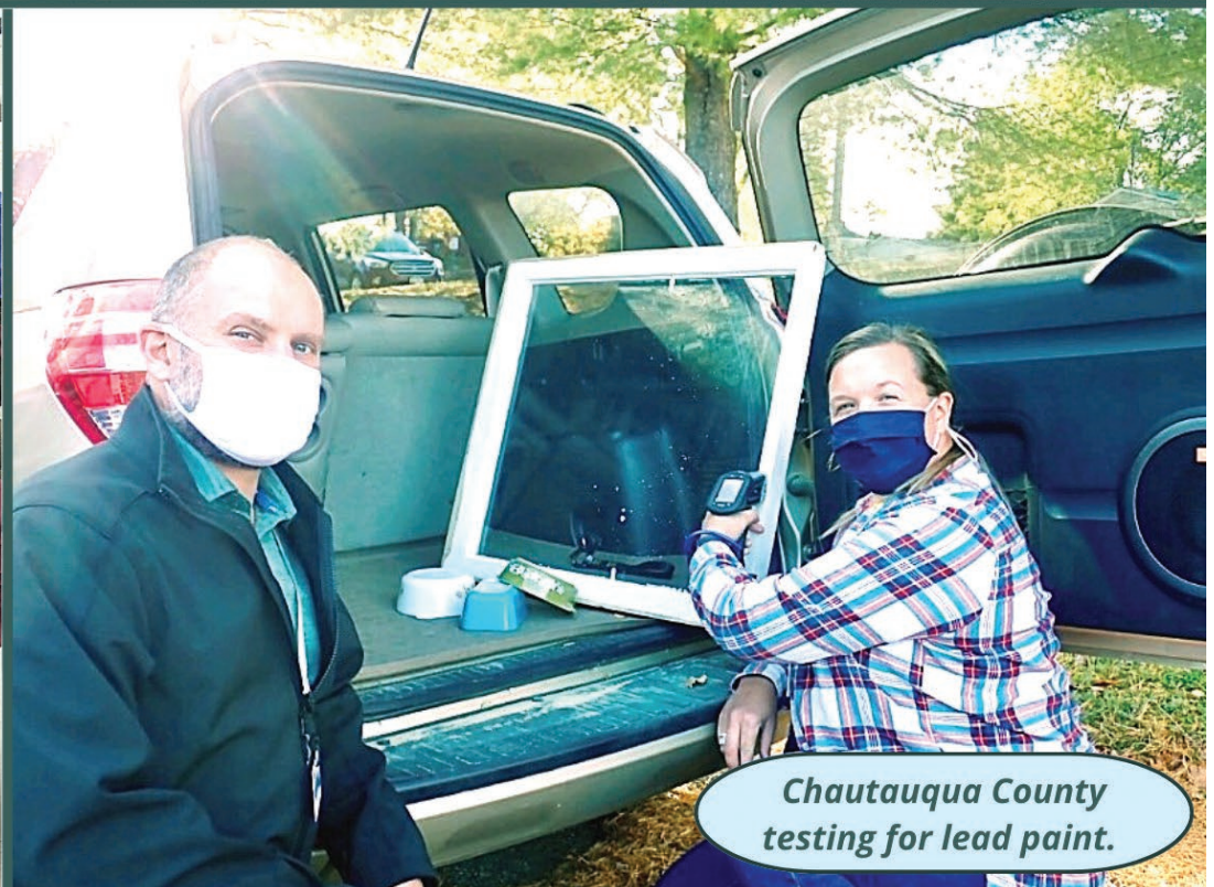
Chautauqua County testing for lead paint.