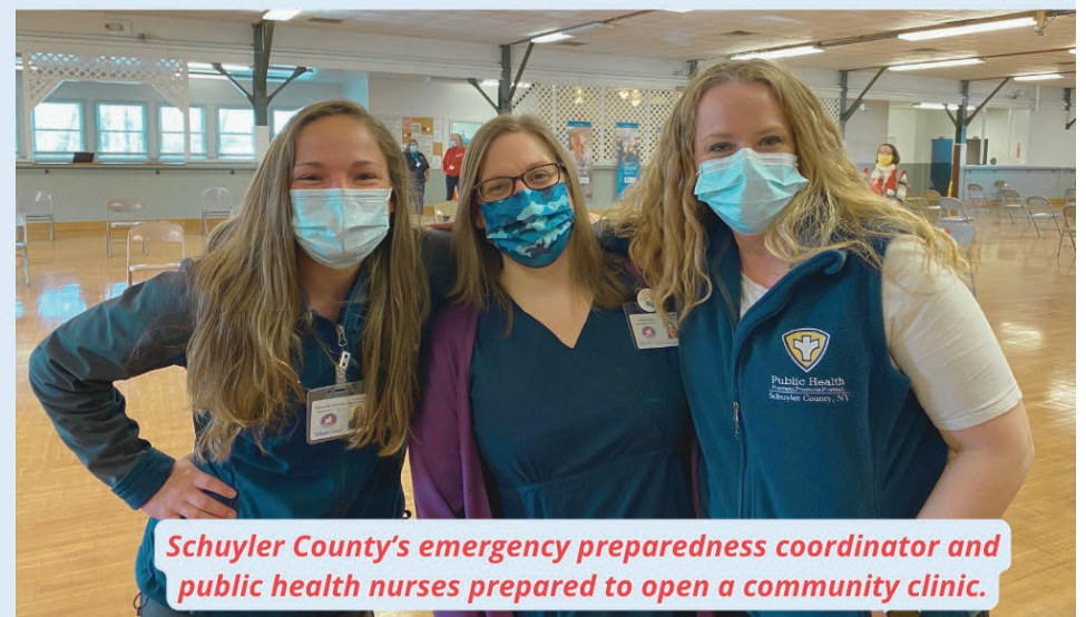
Schuyler County's emergency preparedness coordinator and public health nurses prepared to open a community clinic.