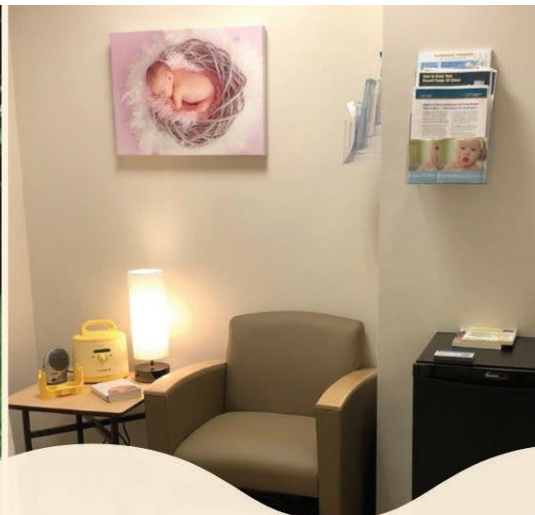
Rockland County helped employers create policies and lactation spaces to support breastfeeding employees.