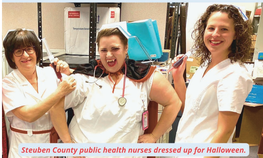
Steuben County public health nurses dressed up for Halloween.