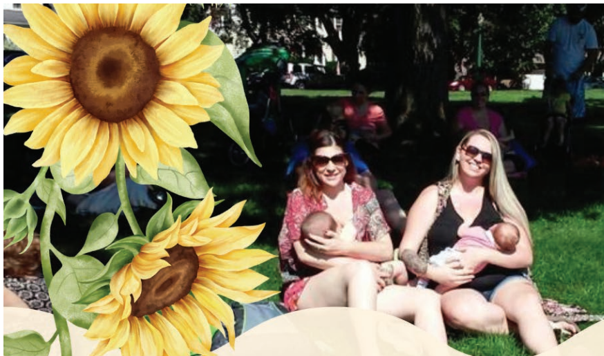
The Big Latch On community event promoted breastfeeding in Cayuga County.