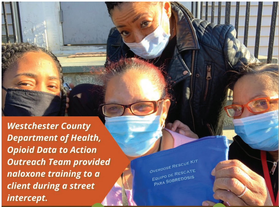
Westchester County Department of Health, Opioid Data to Action Outreach Team provided naloxone training to a client during a street intercept.