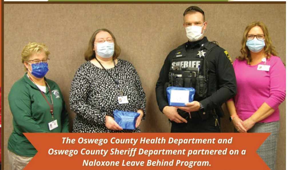
The Oswego County Health Department and Oswego County Sheriff Department partnered on a Naloxone Leave Behind Program.