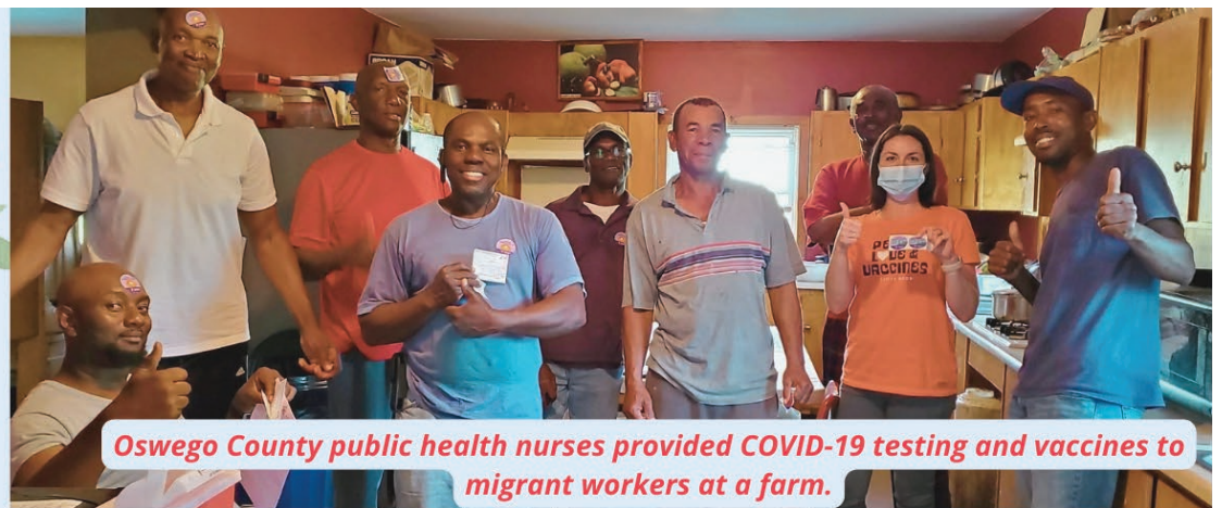
Oswego County public health nurses provided COVID-19 testing and vaccines to migrant workers at a farm.