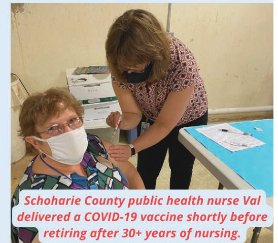
Schoharie County public health nurse Val delivered a COVID-19 vaccine shortly before retiring after 30+ years of nursing.