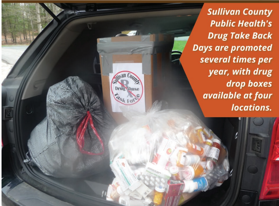
Sullivan County Public Health's Drug Take Back Days are promoted several times per year, with drug drop boxes available at four locations.