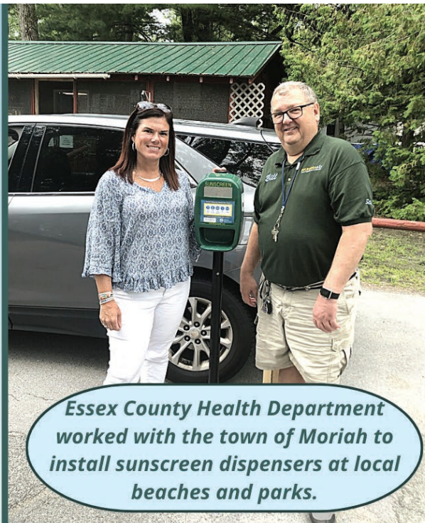
Essex County Health Department worked with the town of Moriah to install sunscreen dispensers at local beaches and parks.